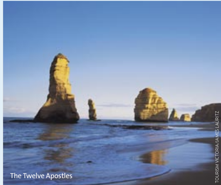
The Twelve Apostles

Past Codrington, Victoria's first wind farm ( www.myportfairy.com/windfarmtours ), which is open for tours, the drive concludes its coastal